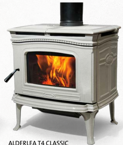
ALDERLEA T4 CLASSIC