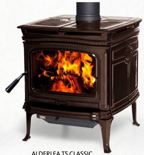
ALDERLEA T5 CLASSIC